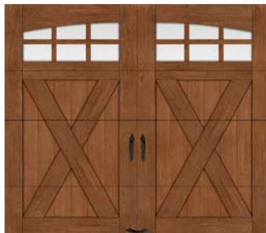
Canyon Ridge® Collection Limited Edition Series Design 21 Shown in Dark Finish with Clear Cypress Cladding, Clear Cypress Overlays and ARCH3 Window Design (Model CAN221CCARCH3).