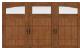
10'4" – 14'10" WIDE DOORS