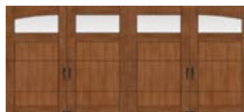
15'0" – 20'0" WIDE DOORS