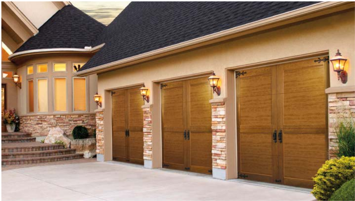
Canyon Ridge® Collection Ultra-Grain® Series Design 36 Shown in Medium Finish with Clear Cypress Overlays and TOP11 (Solid) Top Section (Model CAN236NCTOP11).