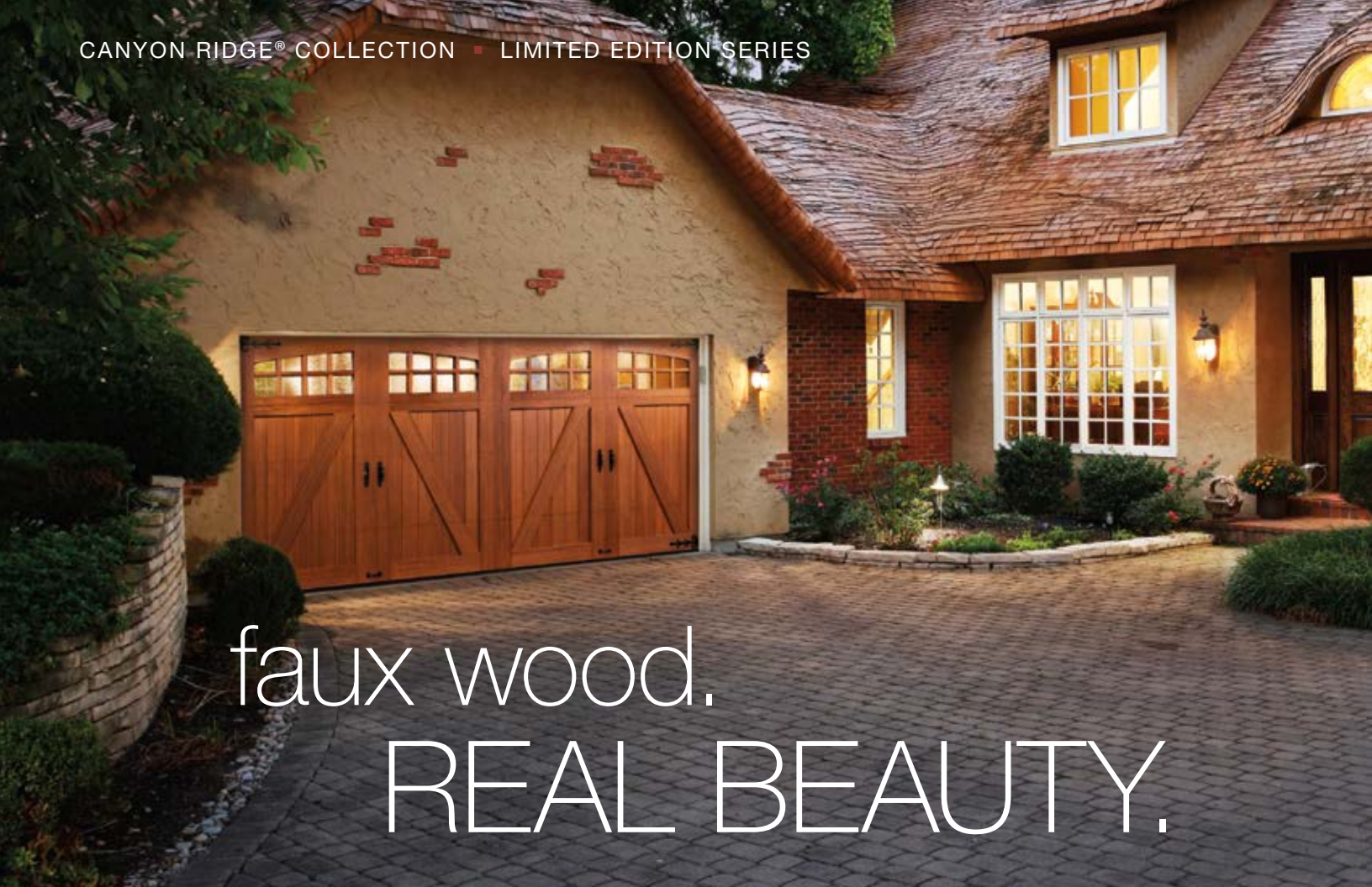
Canyon Ridge® Collection Limited Edition Series Design 22 Shown in Medium Finish with Clear Cypress Cladding, Mahogany Overlays and ARCH4 Window Design (Model CAN222CMARCH4).