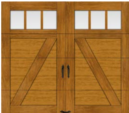
Canyon Ridge® Collection Ultra-Grain® Series Design 22 Shown in Medium Finish with Clear Cypress Overlays and REC13 Window Design (Model CAN222NCREC13).

An attractive and more economical alternative to the Limited Edition Series, this door features a 2" Intellicore® polyurethane insulated steel base door with Ultra-Grain®, a durable, natural-looking, woodgrain paint finish. Stained Clear Cypress composite overlays are applied to the steel door surface to create beautiful carriage house designs.